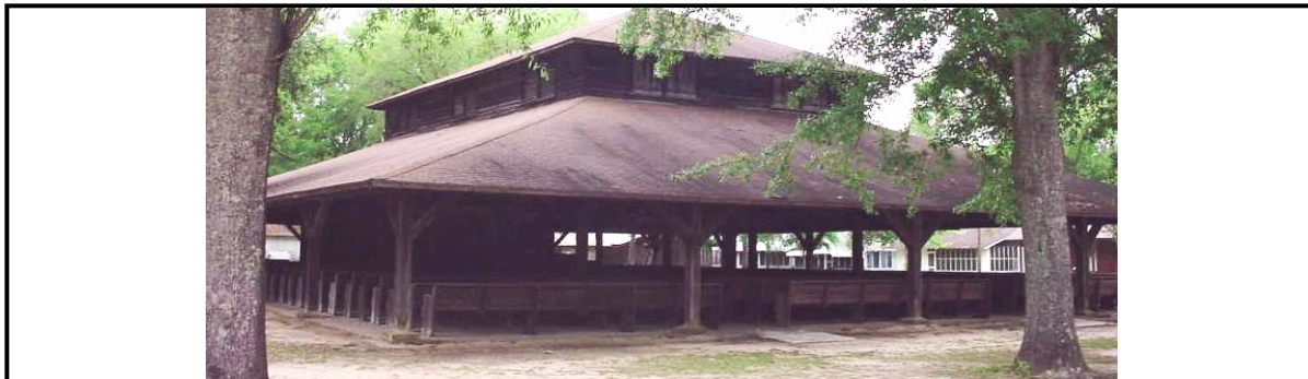
Dayspring Walk to Emmaus