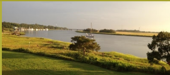
Dayspring Walk to Emmaus